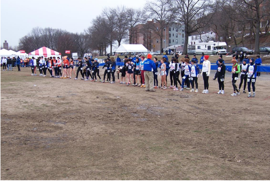
Above: Master Women's start. Van Cortlandt Park - that's Broadway in the background.